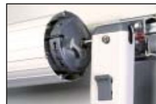
Canopy case protects the fabric.

Elite 9000's satin anodized or painted aluminum wraparound weathershield is a series of precisely hinged extrusions that roll into a sleek canopy case and provide maximum fabric protection.